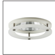
HR - Halo Ring