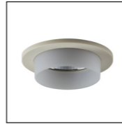
FR -Frosted Ring