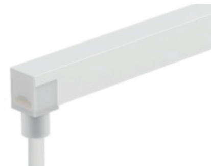
BOTTOM FEED Suffix .BF