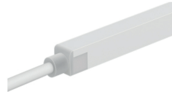
STRAIGHT FEED Suffix .SF