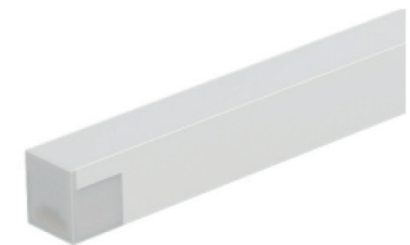
END CAP SUFFIX .EC

Above codes are with cable length of 1000mm Other lengths available on request. Note - mid connector 300mm only.