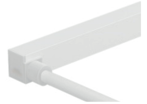
SIDE FEED Suffix .LF Left Feed or .RF Right Feed