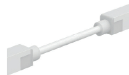
STRAIGHT CONNECTOR Suffix .SC